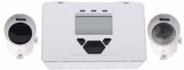
Additional Detector Pack

Test and acceptance of the system shall be carried out by using the UL/ULC approved internal electronic obscuration fire test. The projected beam type smoke detector shall be a 4-wire 24VDC device to be used with a Nationally Recognized Testing Laboratory's Listed and separately supplied 4-wire control panel. The End to End beam type smoke detector shall be a FFE Ltd. Fireray 3000.